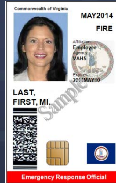
Non-Federal PIV-I Credential

Personal Identity Verification- Interoperable (PIV-I) credentials for state, local, territorial, and tribal (SLTT) stakeholders