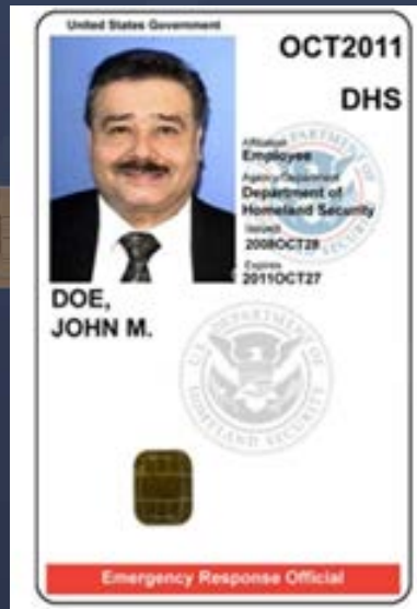
Federal PIV Credential

Federally-approved Personal Identity Verification (PIV) credentials for federal employees and contractors